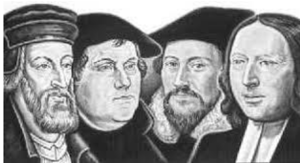
(John Wesley among the Reformers)

Synchronous Class Session Nov. 5 TH (9:00 AM-12:00) on ZOOM.